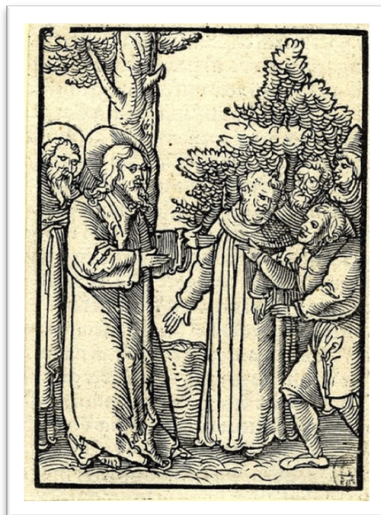
Christ Healing the Deaf Man, Woodcut, Basel (1514)

Pardon for sin and a peace that endureth Thine own dear presence to cheer and to guide; Strength for today and bright hope for tomorrow, Blessings all mine, with ten thousand beside!