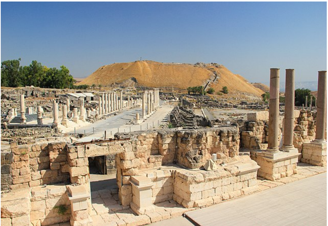
Beit Shein (Scythopolis), a Decapolis city, Israel

34 Then looking up to heaven, he sighed and said to him, 'Ephphatha', that is, 'Be opened.' 35 And immediately his ears were opened, his tongue was released, and he spoke plainly. 36 Then Jesus ordered them to tell no one; but the more he ordered them, the more zealously they proclaimed it. 37 They were astounded beyond measure, saying, 'He has done everything well; he even makes the deaf to hear and the mute to speak.'