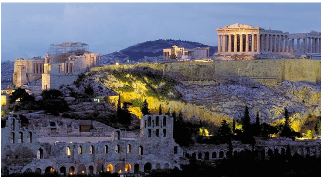
Acropolis and Parthenon, Athens

‘The God who made the world and everything in it... does not live in shrines made by human hands’ Acts 17:24