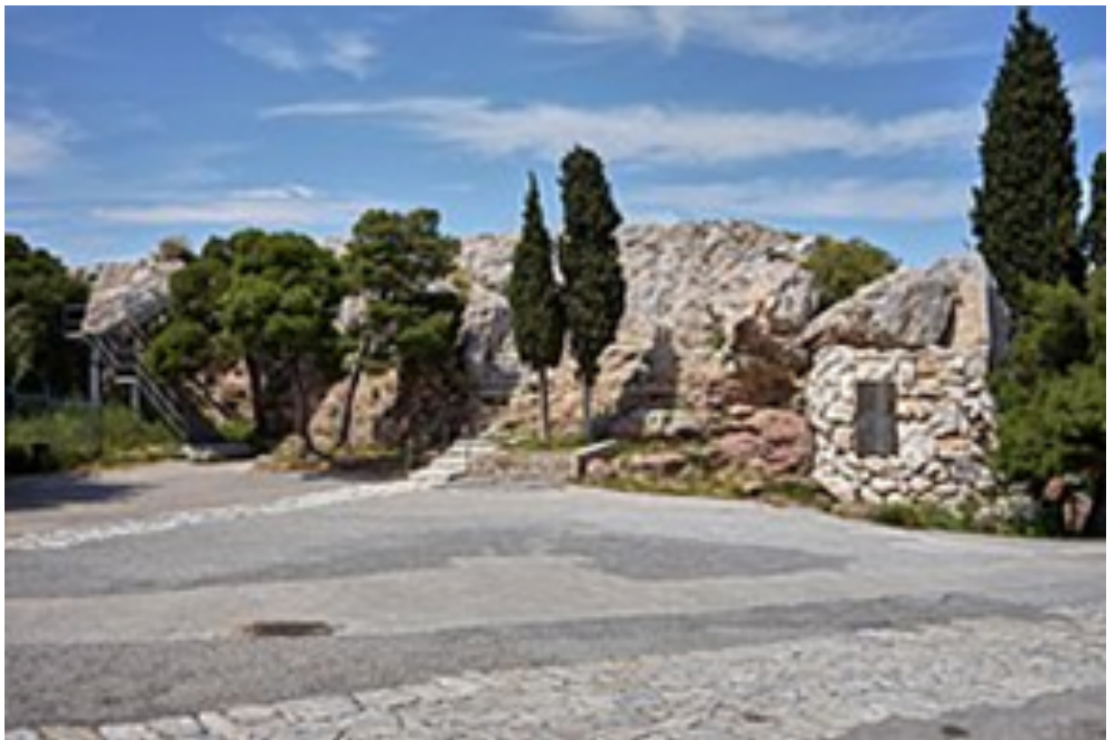
Areopagus Hill, Site Where Paul Preached

Faint not nor fear, His arm is near, He does not change, and you are dear; Only believe, and Christ shall be Your all in all eternally.