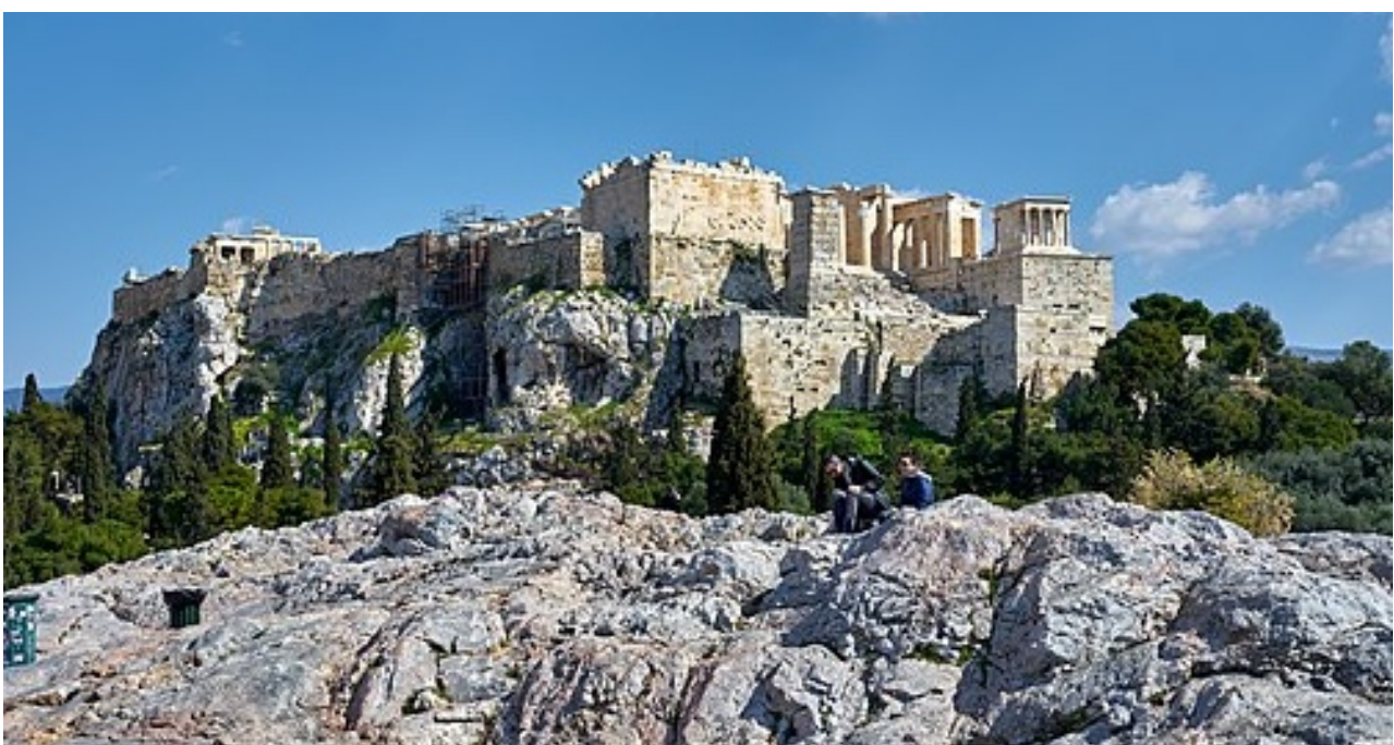
Areopagus Hill (looking to the Acropolis), Athens

22 Then Paul stood in front of the Areopagus and said, “Athenians, I see how extremely religious you are in every way. 23 For as I went through the city and looked carefully at the objects of your worship, I found among them an altar with the inscription, ‘To an unknown god.’ What therefore you worship as unknown, this I proclaim to you. 24 The God who made the world and everything in it, he who is Lord of heaven and earth, does not live in shrines made by human hands, 25 nor is he served by human hands, as though he needed anything, since he himself gives to all mortals life and breath and all things. 26 From one ancestor he made all nations to inhabit the whole earth, and he allotted the times of their existence and the boundaries of the places where they would live, 27 so that they would search for God and perhaps grope for him and find him—though indeed he is not far from each one of us. 28 For ‘In him we live and move and have our being’; as even some of your own poets have said, ‘For we too are his offspring.’