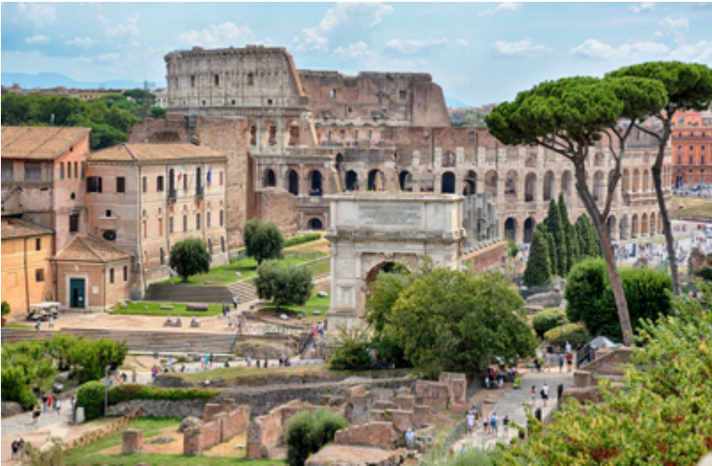
Forum and Colosseum, Rome

'I can do all things through him who strengthens me' Philippians 4:13