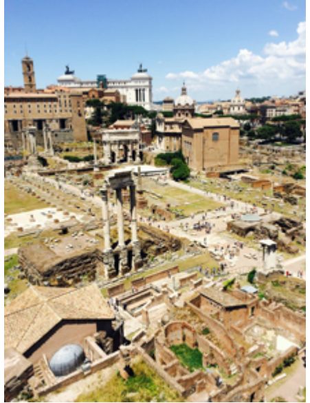
Via Sacra, Rome

11 Three months later we set sail on a ship that had wintered at the island, an Alexandrian ship with the Twin Brothers as its figurehead. 12 We put in at Syracuse and stayed there for three days; 13 then we weighed anchor and came to Rhegium. After one day there a south wind sprang up, and on the second day we came to Puteoli. 14 There we found believers and were invited to stay with them for seven days. And so we came to Rome. 15 The believers from there, when they heard of us, came as far as the Forum of Appius and Three Taverns to meet us. On seeing them, Paul thanked God and took courage.