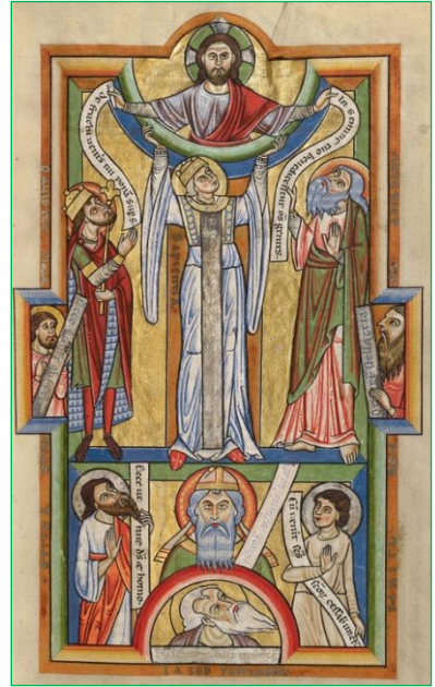
'Wisdom' (c. 1170 AD), J. Paul Getty Museum, Los Angeles