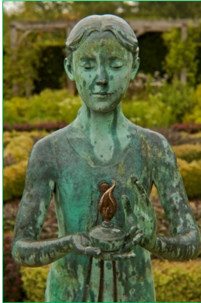
Lamp of Wisdom, Waterperry Gardens, Oxfordshire

Know also that wisdom is sweet to your soul; if you find it, there is a future hope for you, and your hope will not be cut off - Proverbs 24:14