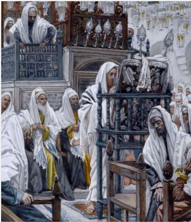
'Jesus Unrolls the Scroll in the Synagogue' - James Tissot (1836 - 1902)