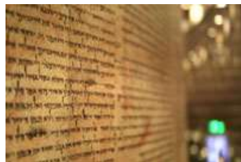
Scroll (250BC to 50AD), from the 'Dead Sea Scrolls', found at Qumran

14 Then Jesus, filled with the power of the Spirit, returned to Galilee, and a report about him spread through all the surrounding country. 15 He began to teach in their synagogues and was praised by everyone.