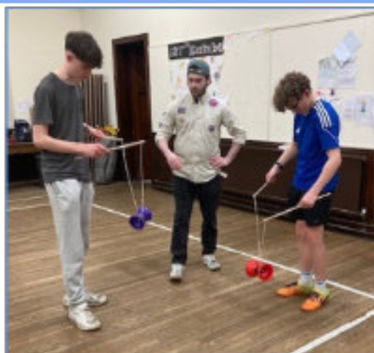
Some of the Scouts practising the diabolo

Newington Trinity Church - Priestfield 2 Marchhall Place, Edinburgh EH16 5HW Scottish Charity No SCO35115