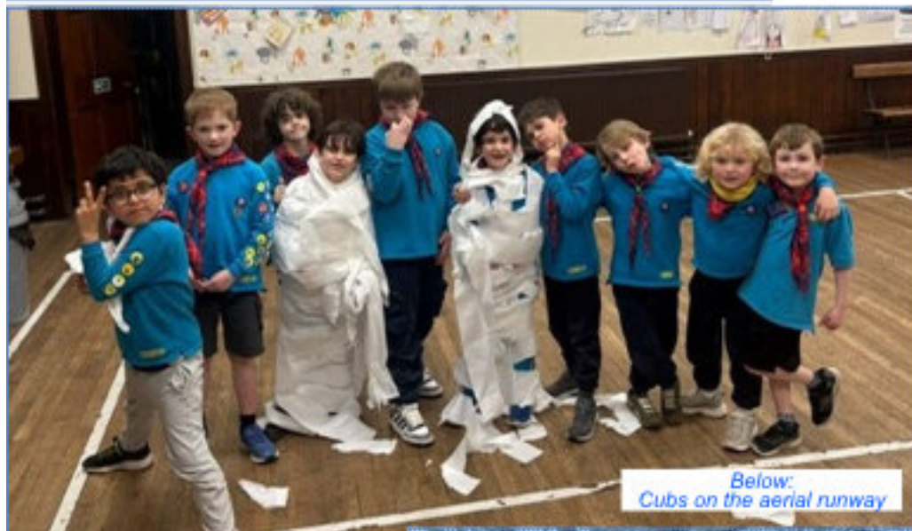
Below: Cubs on the aerial runway

Here are the Beavers at end of term fun night wrapping one another as snowmen