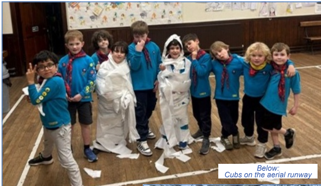
Below: Cubs on the aerial runway