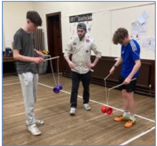
Some of the Scouts practising the diabolo

Newington Trinity Church - Priestfield 2 Marchhall Place, Edinburgh EH16 5HW Scottish Charity No SCO35115