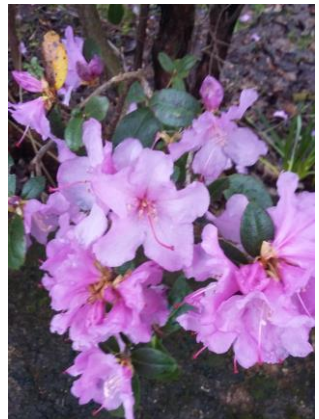
Used with permission

Bless the Lord, O my soul, and do not forget all his benefits- who forgives all your iniquity, who heals all your diseases; who redeems your life from the Pit, who crowns you with steadfast love and mercy, who satisfies you with good as long as you live so that your youth is renewed like the eagle's.