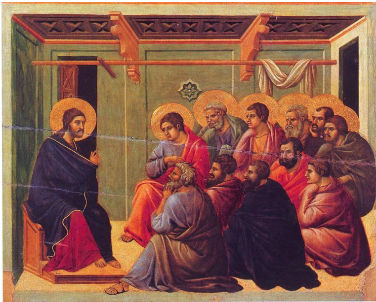
Farewell Discourse depiction from the Maesta by Duccio, 1308 – 1311