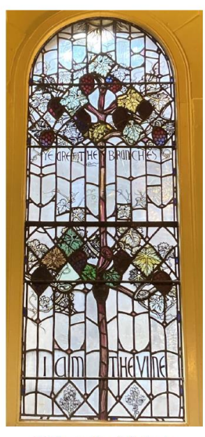
Window in Priestfield Church

How might it feel to be part of the vine? Not just to see the vineyard from afar Or even pluck the clusters, press the wine, But to be grafted in, to feel the stir Of inward sap that rises from our root, Himself deep planted in the ground of Love, To feel a leaf unfold a tender shoot, As tendrils curled unfurl, as branches give A little to the swelling of the grape, In gradual perfection, round and full, To bear within oneself the joy and hope Of God's good vintage, till it's ripe and whole. What might it mean to bide and to abide In such rich love as makes the poor heart glad?